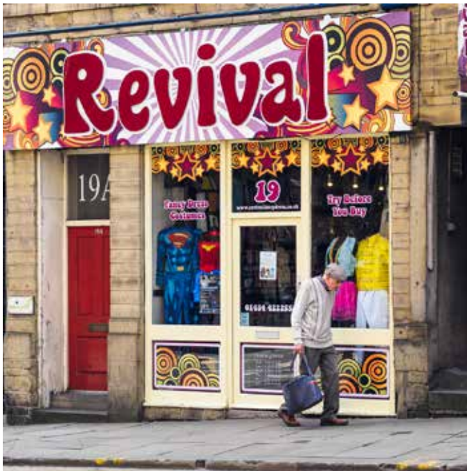
Vol 1 p43 Huddersfield