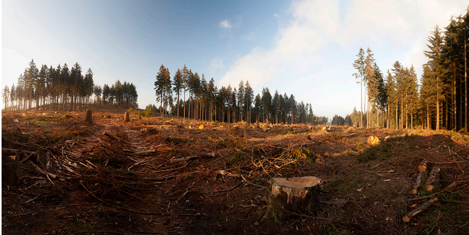
Aindreas Philip Scholz - Clearing (50°15'03.6"N 8°29'00.3"E)

This panorama image taken in September 2020 shows thousands of dried-out spruces in Germany's Taunus mountain region, which had to be felled after 500 hectares of woodland were damaged by bark beetles. A succession of abnormally dry summers have stressed forests across Germany, making them more susceptible to pests.