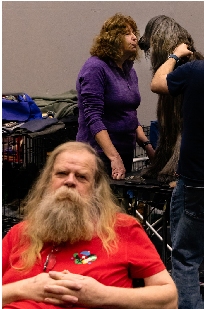
Crufts 2020 - Hounds & Terriers Day

Crufts 2020 in early March was my last photo-trip before 9 months of shielding. I have attended Crufts annually for 15+ years, documenting the dogs and their people during the course of this highly competitive event. This picture shows an owner preparing her Afghan Hound for an early round.