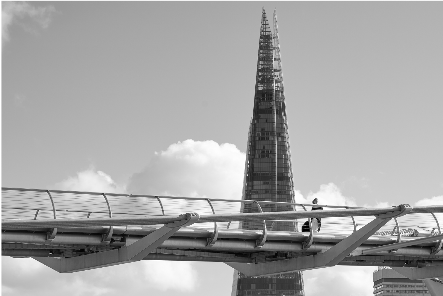
Dain Evans - Dystopia/20

Taken in November on a regular walk through central London during the 2020 COVID-19 restrictions, this image was a spontaneous grab shot of a lone woman crossing the Millennium Bridge with the Shard in the background. The scene caught my attention as she was the only person in sight on the bridge as she slowed down to look at the view. The architectural elements of the Shard and deserted bridge, juxtaposed with the single gazing figure, her clothes billowing in the wind, felt strangely dystopian, like a scene from a film. As such, I feel it symbolises the surreal nature of 2020.