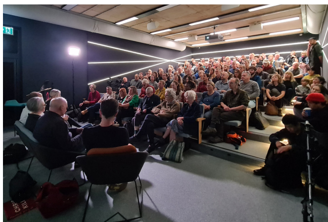
Public Talk in the auditorium at RPS House, October 2022

In October, BOP22 - Books on Photography - was held in partnership with the Martin Parr Foundation and saw some 1500 people engaging with the public talks programme (held in RPS House) and meeting photobook publishers across RPS, MPF and Paintworks.