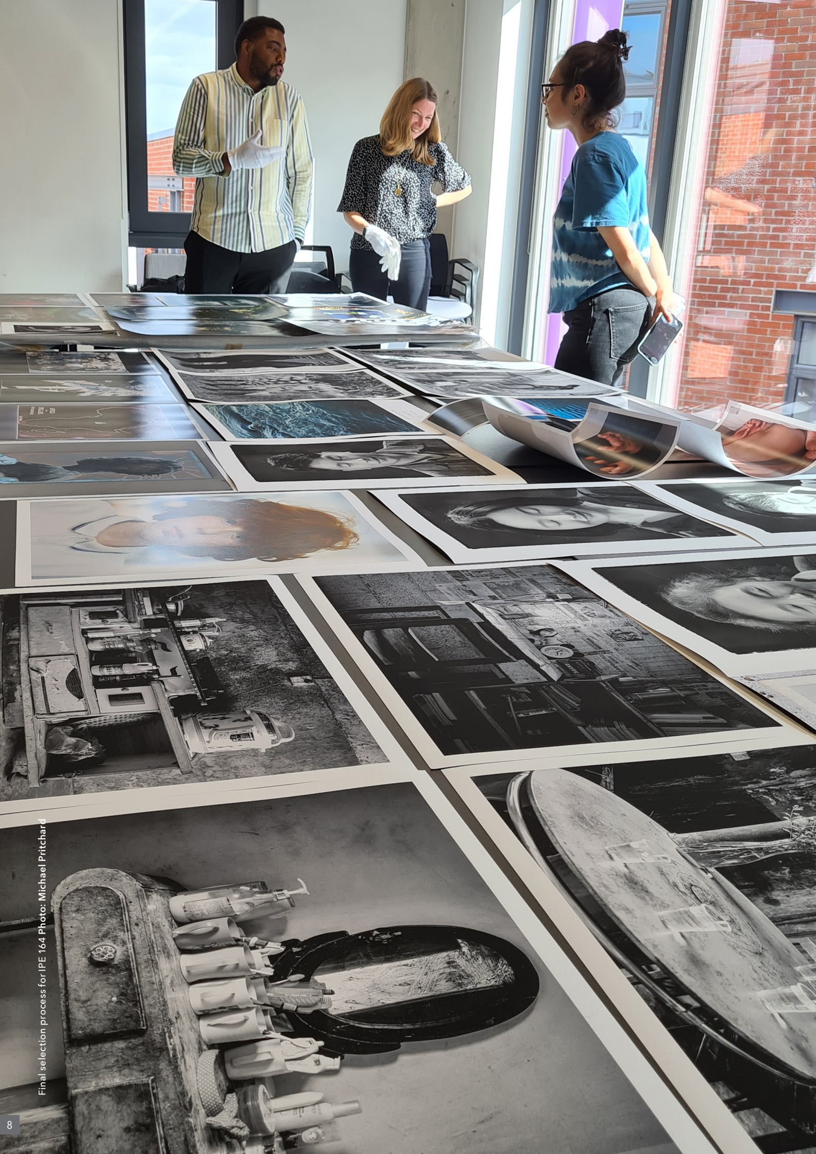
Final selection process for IPE 164