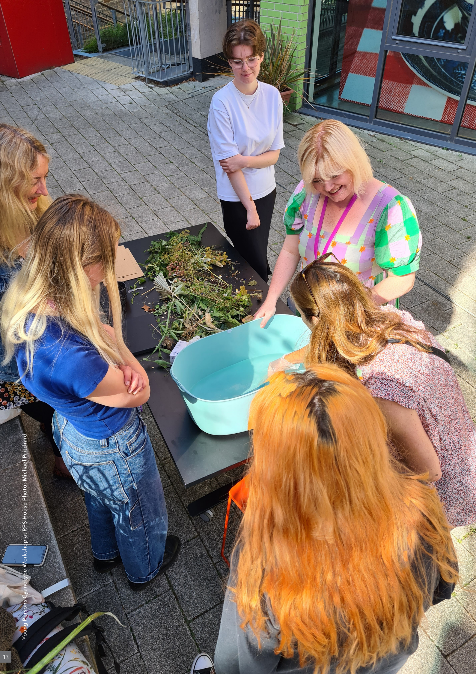
Young Persons Cyanotype Workshop at RPS House