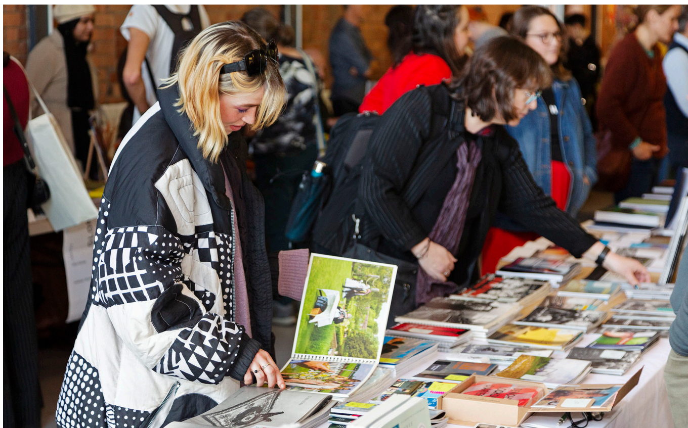
BOP 2022

Through 2022, a series of photographers and artists from the Photobook Collective presented talks about their work, which complemented their books on sale in RPS House. The initiative particularly engaged the local student community.