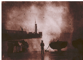
Hill and Adamson