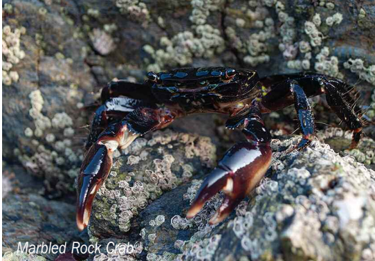
Marbled Rock Crab