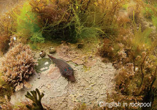
Clingfish in rockpool

unseen world. A compact can be very handy for use in rockpools with small crevices, but shooting with a DSLR leads to more success in the larger rockpools.