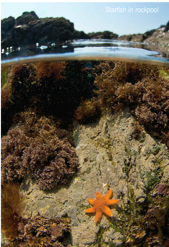
Starfish in rockpool