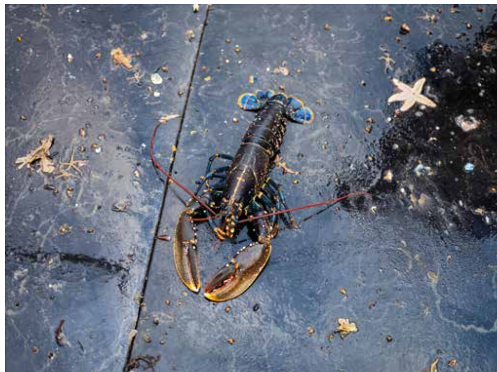
'A female lobster is v-notched before being returned to the water, marking it as illegal for landing' by Tessa Bunney

“It would be nice for the fishermen to have something in public that tells their story, rather than having to tell it themselves”