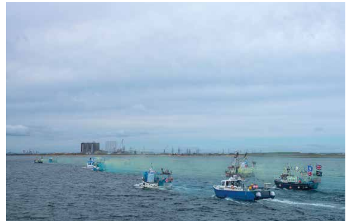
'Fishermen sail to South Gare for a Save Our Sea protest against dredging, 19 May 2022'

“Over the years I’ve worked with lots of farmers, small food producers, and people that have a connection to the landscape”