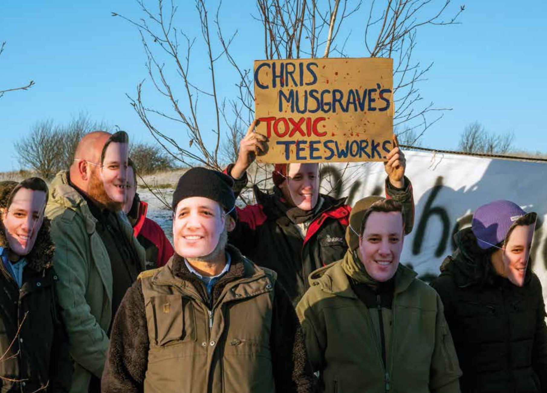
'Teesside and North Yorkshire coast fishermen join environmental campaigners to protest at Teesworks entrance, Redcar, 14 December 2022' by Tessa Bunney