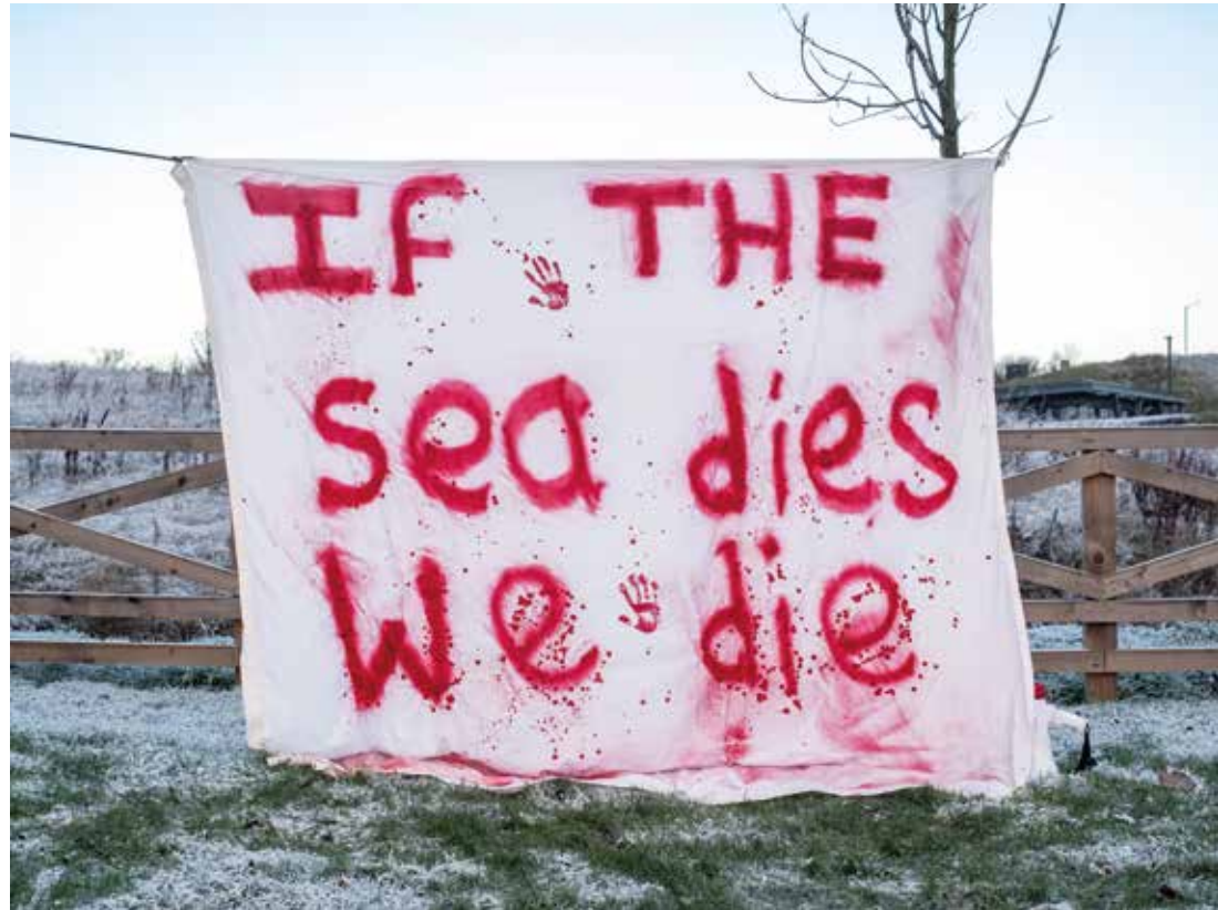
'Fishermen's protest against Tees dredging outside Teesworks, Redcar, on 14 December 2022'

“It would be nice for the fishermen to have something in public that tells their story, rather than having to tell it themselves”