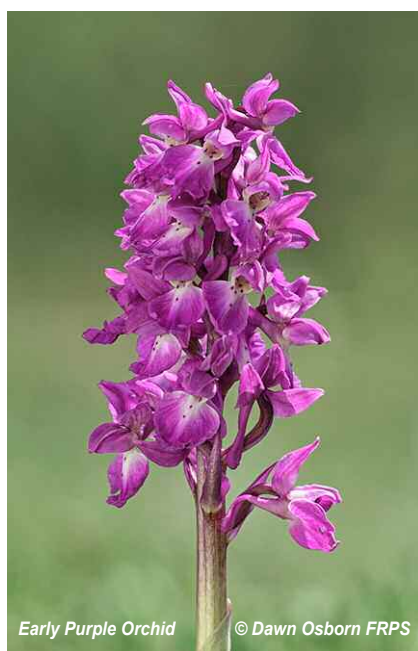
Early Purple Orchid