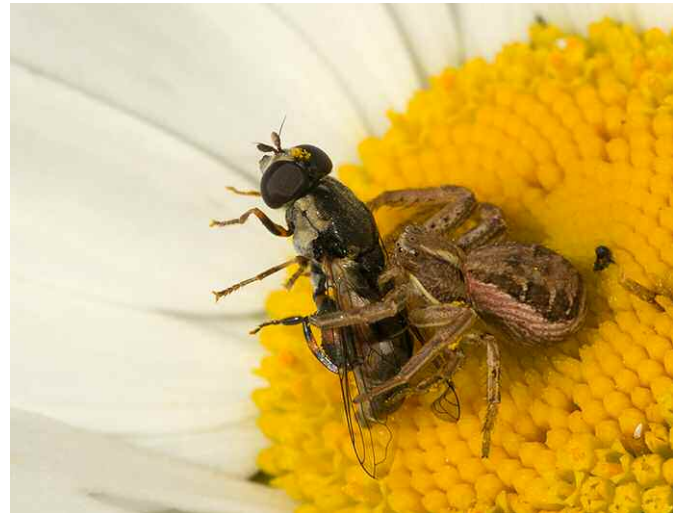
Above: Crab spider (Xysticus sp) w Syrretta pipiens prey

Thank you to all who have already volunteered to run Field Meetings. It is very much appreciated.