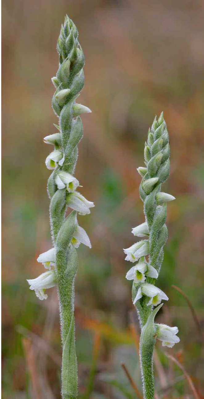
Autumn Ladies-tresses - Spiranthes spiralis by Richard Revels FRPS

The Autumn Ladies Tresses Spiranthes spiralis is Britain's latest flowering orchid, usually coming into bloom from about mid-August to late September, depending upon seasonal weather conditions.