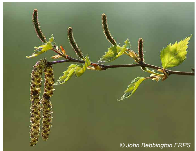
Above: Silver Birch ( Betula pendula ) male & female catkins (1) Below: Death's Head Hawk-moth ( Acherontia atropos ) larva early 5th instar