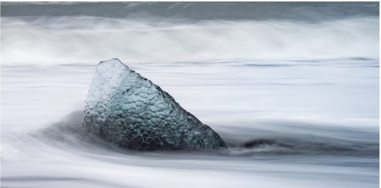
Alistair How LRPS

This is the process of 'upsampling' an image to a higher resolution than its original capture resolution, a technique that some artificial intelligence applications can achieve with great success. It is also known as "rezzing-up" and is typically used to prepare images for large-format printing, create high-quality prints, or match the resolution requirements of specific output devices or platforms. While increasing the resolution can offer certain benefits, there are also potential pitfalls to consider including loss of sharpness, artefacts, and increased file size.