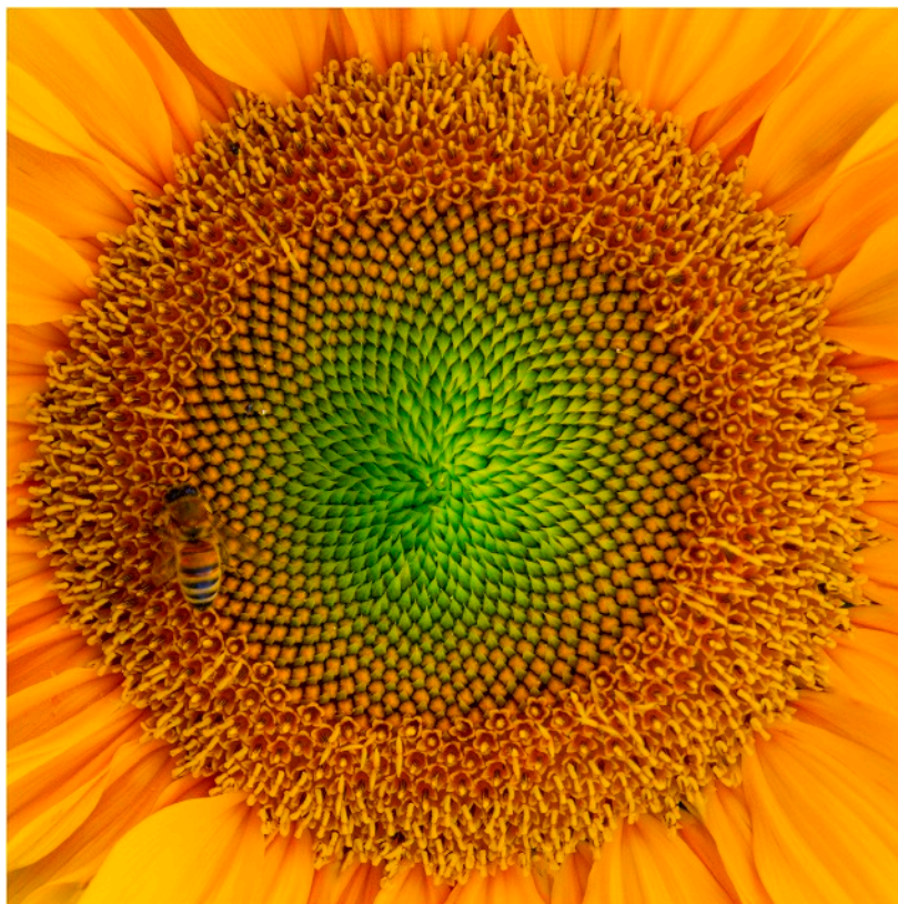
Ian Byers LRPS

The portfolio to be submitted for assessment at Licentiate comprises 10 digital images , ordered and presented in a specific way, of the photographer's own choosing, that demonstrates the technical skills and artistic vision of the photographer. Each of the photographs must not only showcase proficiency in the art and craft of photography but may also evoke emotion and engage the viewer on a deeper level.