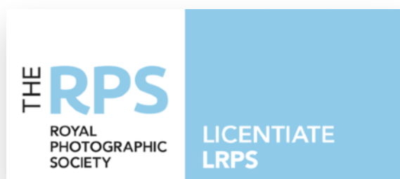
The RPS Licentiate emblem

All applicants will be notified of the final results within 6 weeks of the closing date. On rare occasions, for example due to illness or other exceptional or unforeseen circumstance, this timeframe might be exceeded.