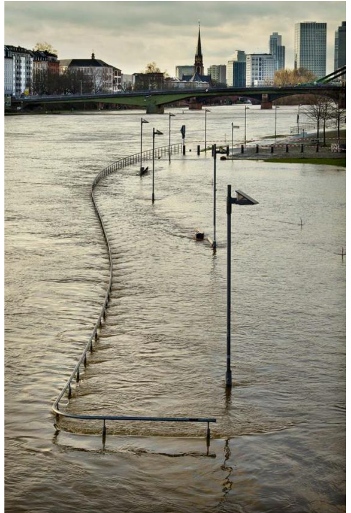
The flooded Main River at Frankfurt