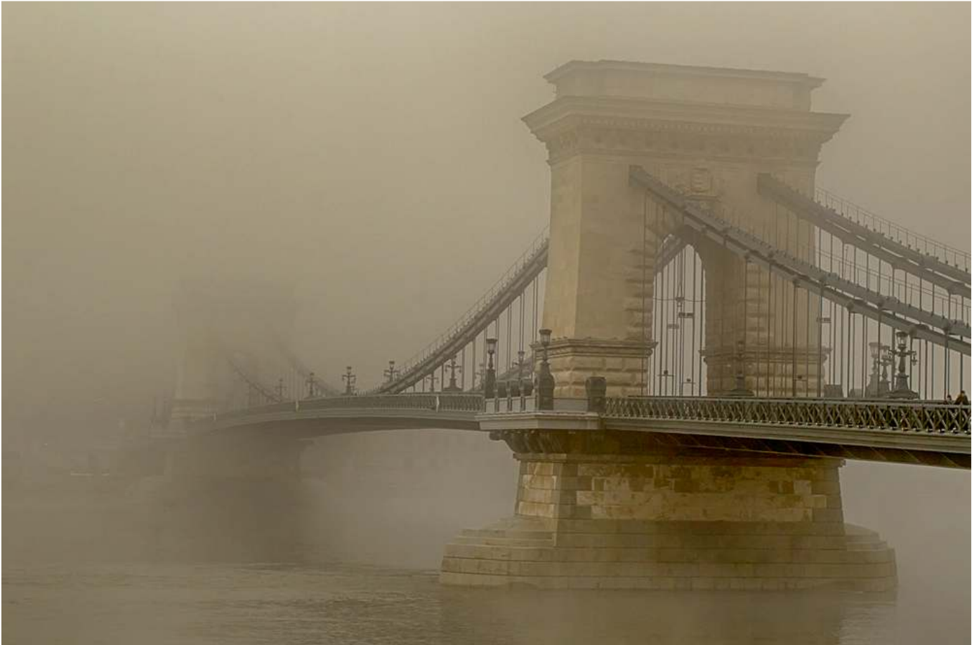
Chain Bridge, Budapest