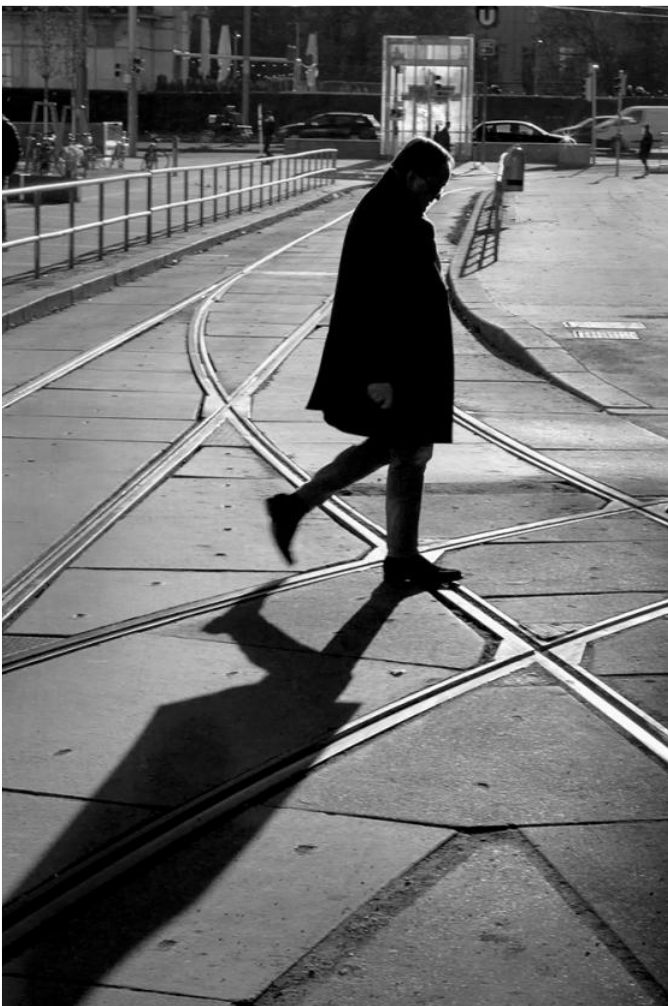
On track in Vienna

Here are a few of my images from our trip.