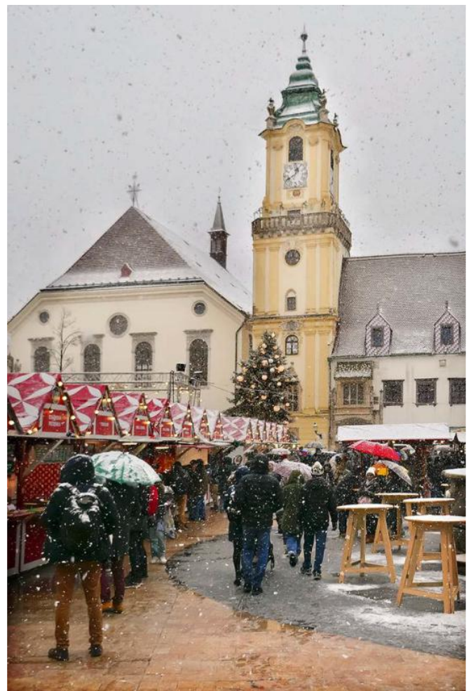
Snowy day in Bratislava