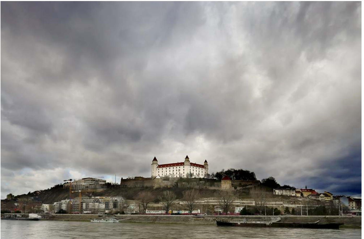
Bratislava Castle