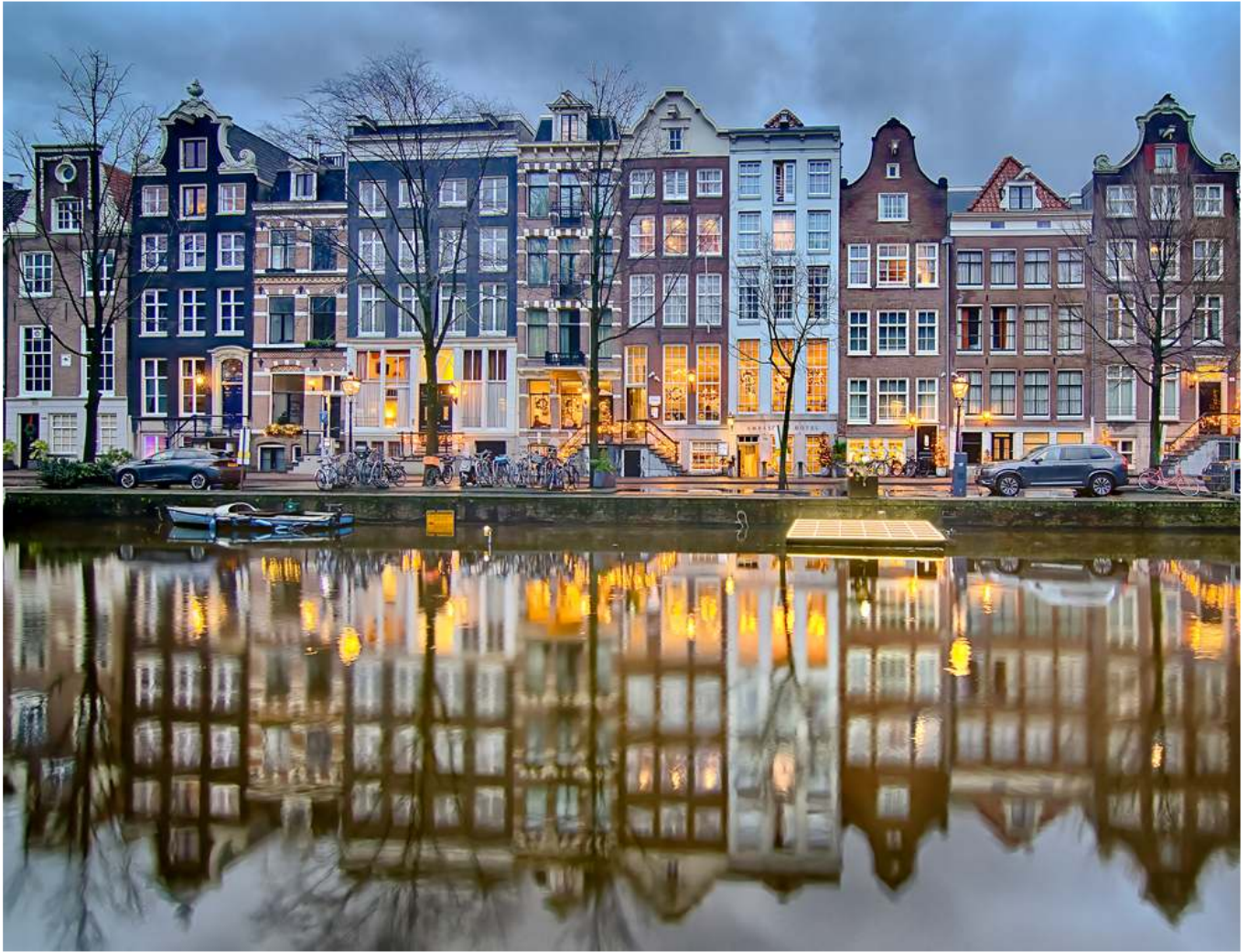
Herengracht reflections, Amsterdam