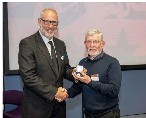
Best Nature Photography: Keith Leedham