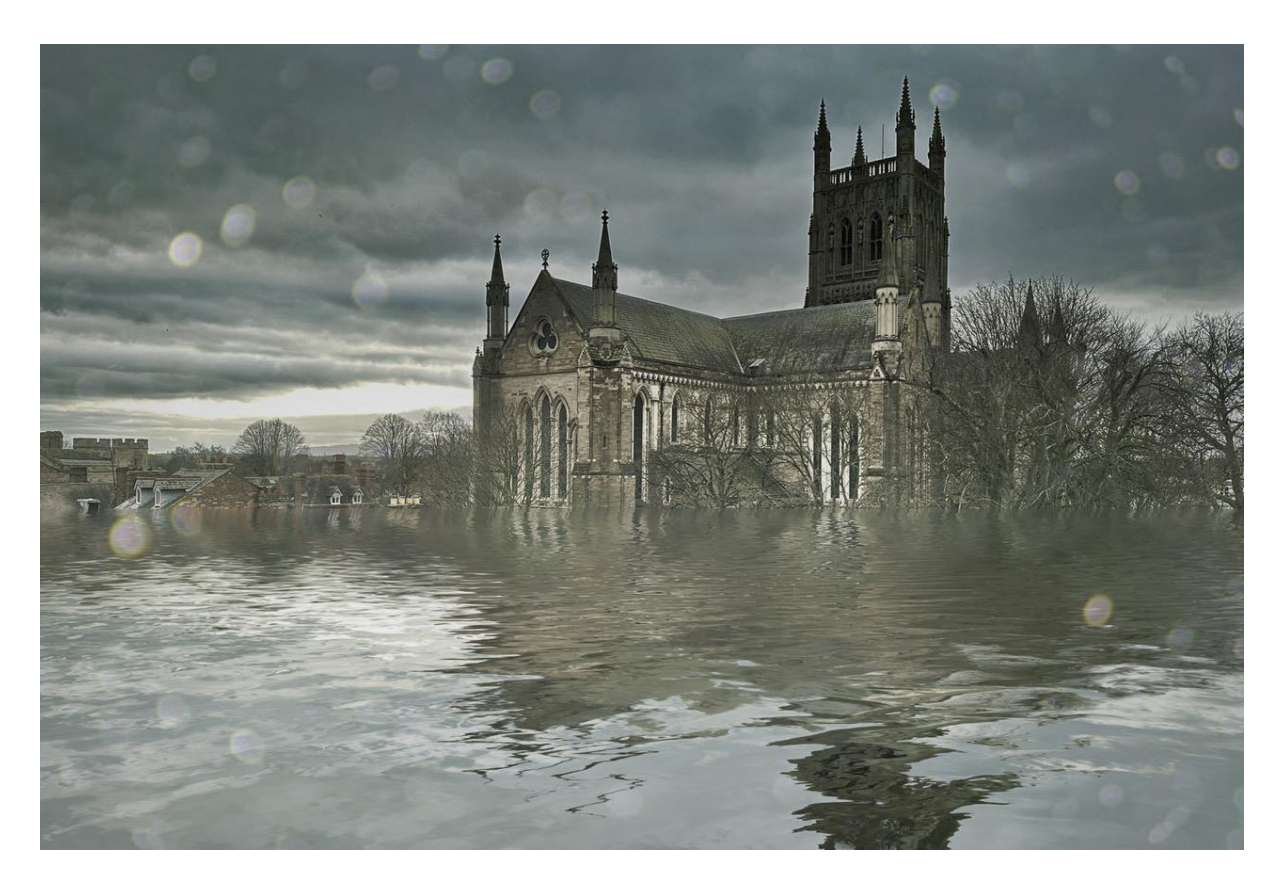
All the best,