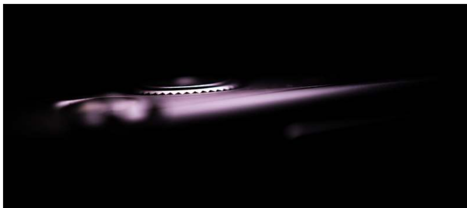
Discus throw at the Olympics by Herman Lee

A camera's primary function is to be used to capture and create visual art. If we carefully and thoughtfully consider and observe the camera, anyone can appreciate the shape and features of it to be eye catching and unique. Many cameras, regardless of texture, shape, colour, or contour can be considered beautiful and inspirational to the artistic mind.