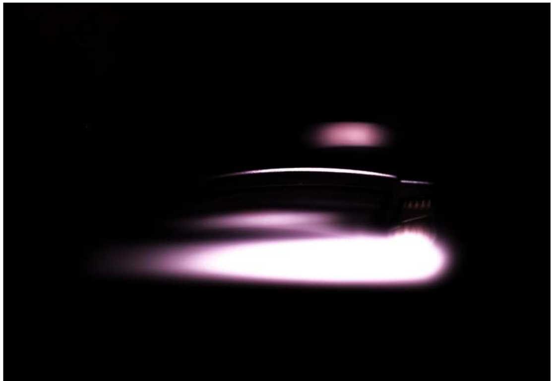
100 metres at the Olympics by Herman Lee