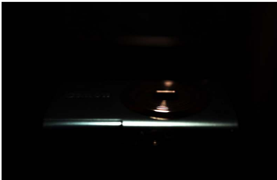
Figure skating at the Olympics by Herman Lee

On top of it all, I have also incorporated Surrealism in the way I viewed and captured the subject. I looked deeper into the hidden elements, which I discovered to surpass a camera's exterior appearance. Therefore, the camera's original function as a tool to capture images is no longer a factor. I have remodelled and recast the camera into a new revelation, a fresh and novel way which calls light to the strength and skill of an Olympic athlete.