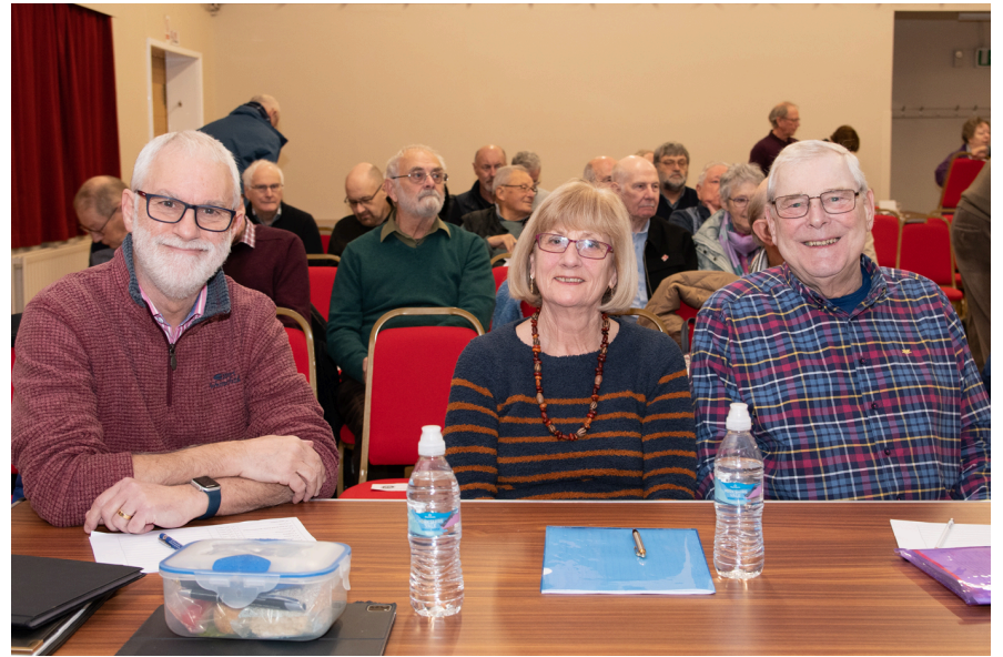
Judging is a thirsty job!