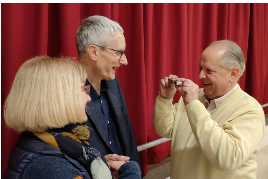
Fun with the Minox