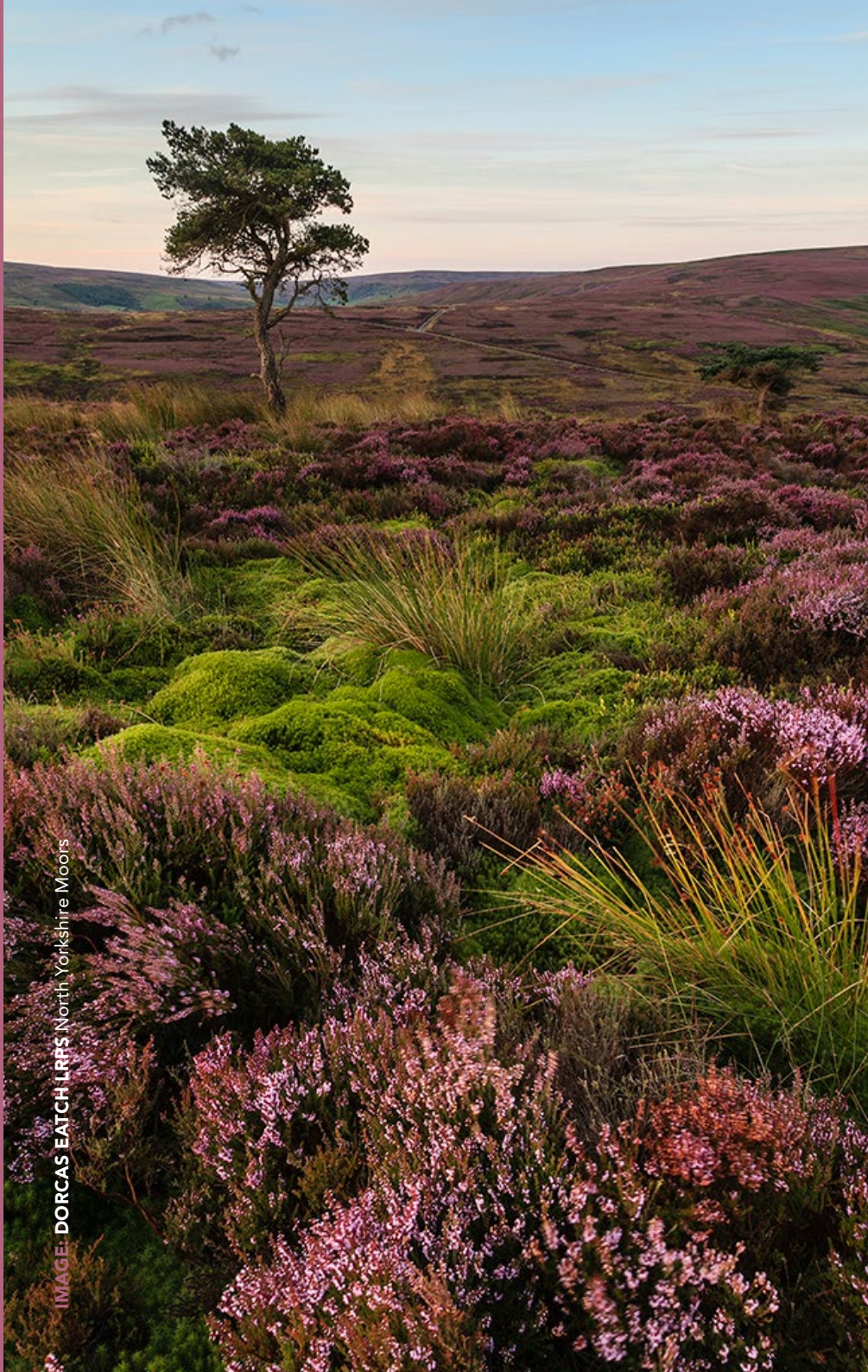
LRP5 North Yorkshire Moors