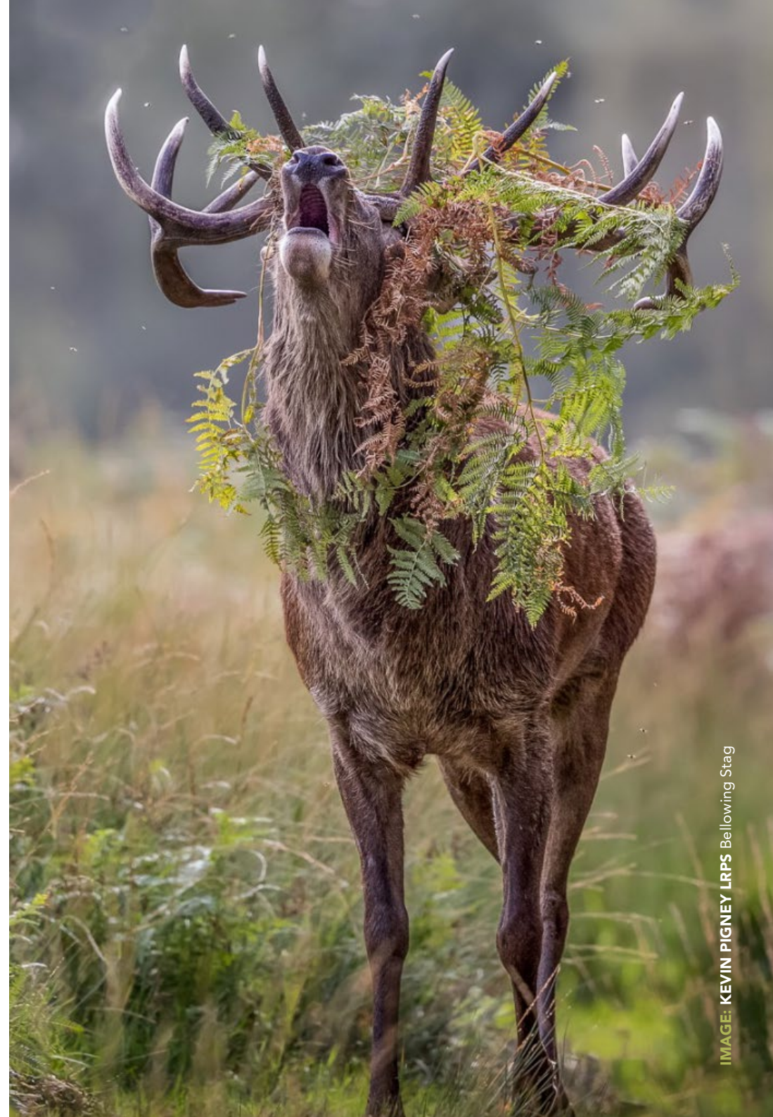
Bellowing Stag

Trustees are elected by the membership every two years. Trustees may also co-opt up to three additional members to the Board of Trustees. These are people who bring particular skills or expertise.