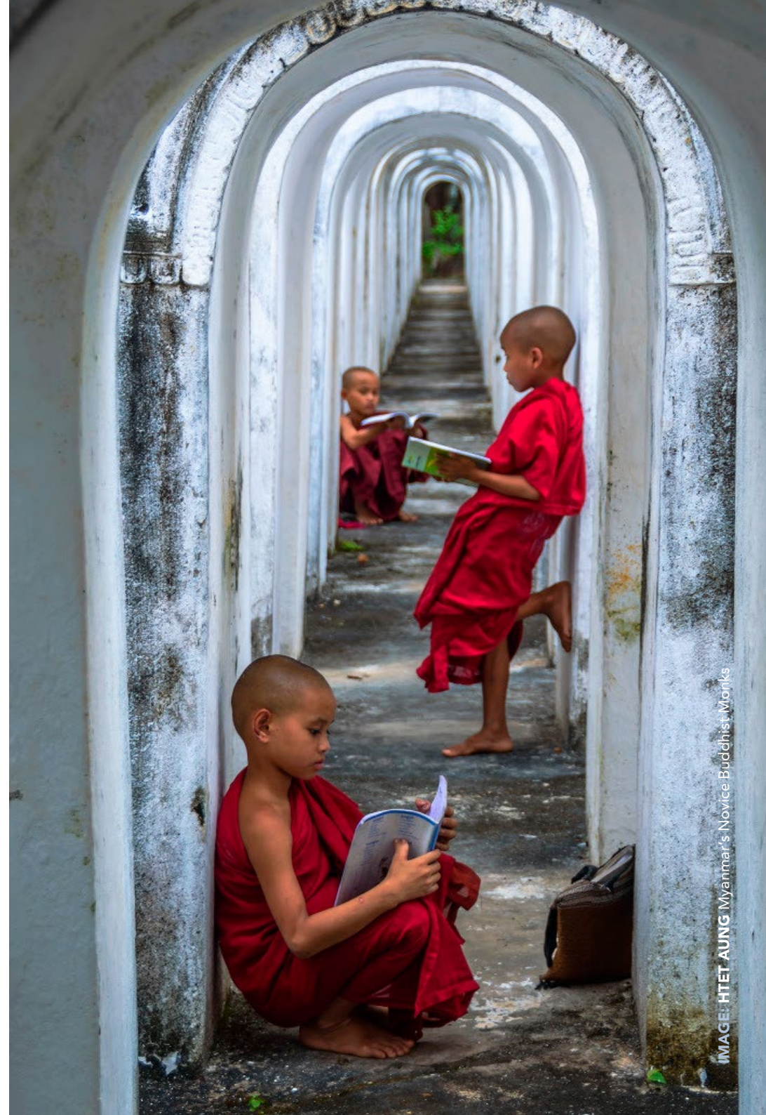
Myanmar's Novice Buddhist Monks