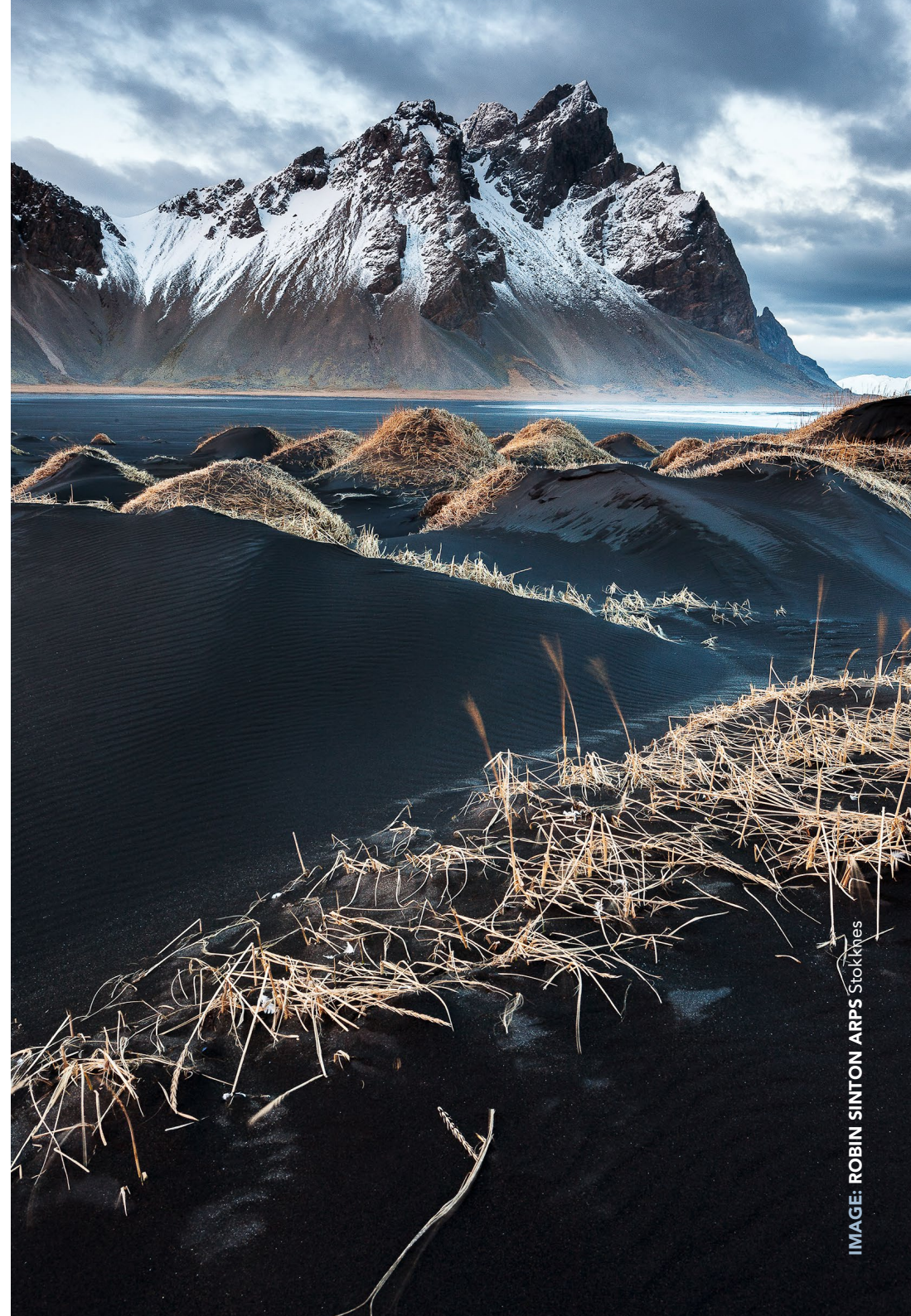
Stokknes

Implement strategy and manage RPS activities. Governance and management of: awards, distinctions, education, exhibitions, finance, IT, communications, membership, volunteers.