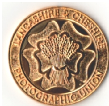
L&CPU Gold Medal