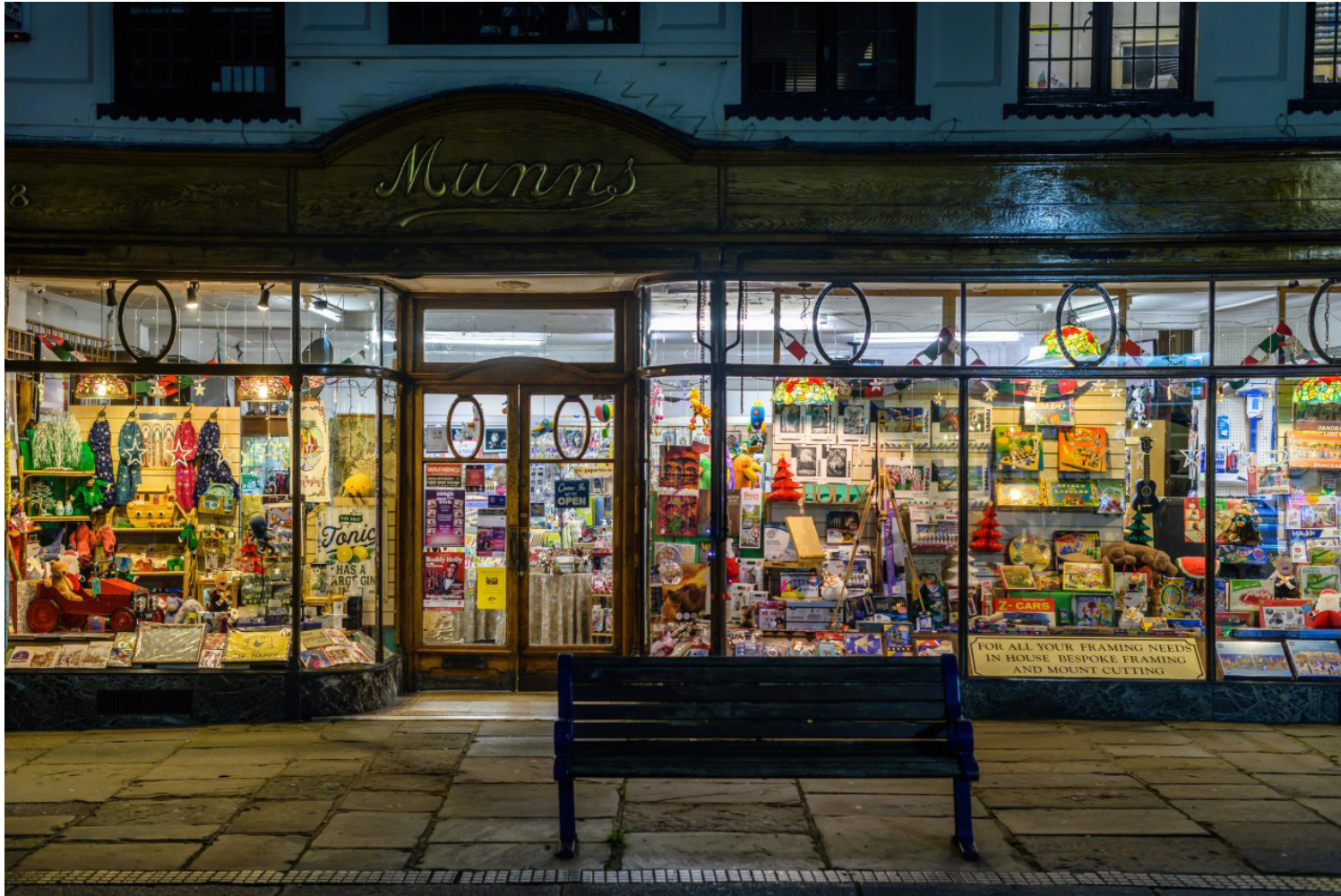
Munns Shop Front, 8 The High Street Gravesend after dark on 16-11-2019

One of my best friends from University grew up and raised his own family in Gravesend took it upon himself to show me around before dinner later that evening. As a result, this is one of a series of hand held night shots I recorded as we walked around, ranging from the arrival of one of the world's biggest sea going cranes to Tilbury Docks from Antwerp ... to a concert of Sea Shanties given by folk singers in the Converted Church on the Sea Front that's now an Arts Centre to the High Street in the Old Quarter of the town itself.