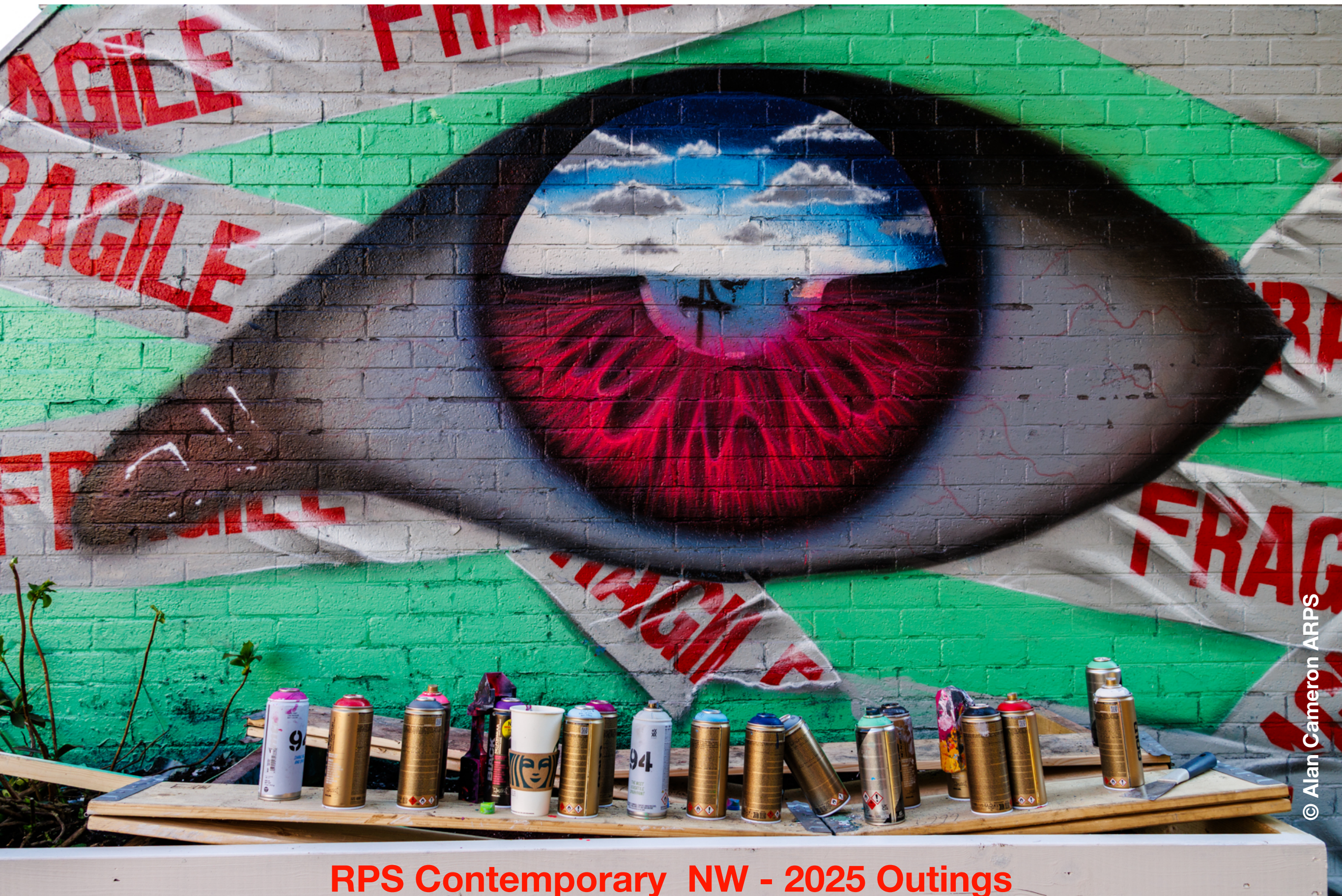
RPS Contemporary NW - 2025 Outings Manchester, March